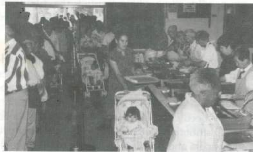
People Helping People

Our Volunteers, over 140 strong, are professionals, retirees, high school students and others who are involved in the community.